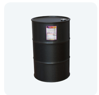
208-liter drums for trucks and heavy duty equipment