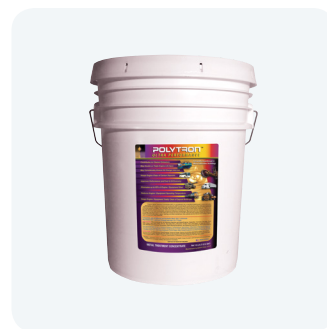
19-liter (5-gal) pails for trucks and heavy-duty equipment