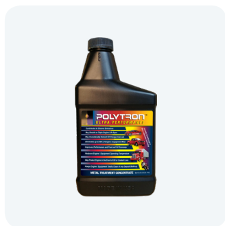
16-ounce (473 ml) plastic bottles for passenger cars and pickup trucks